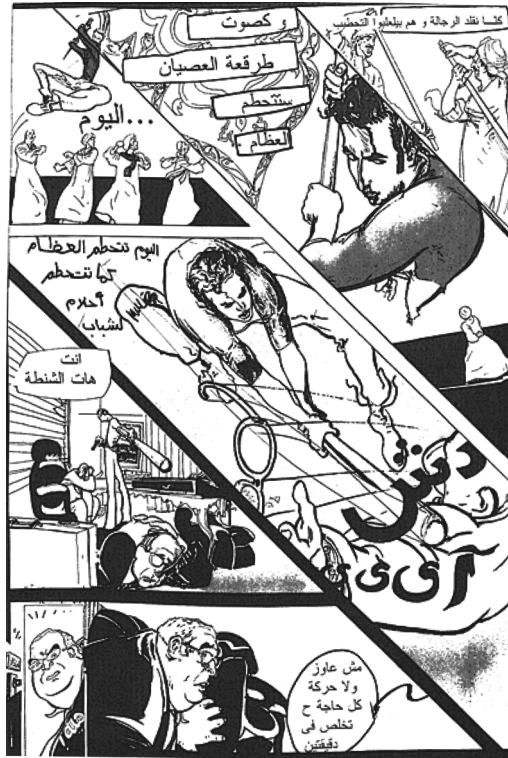
Figure 2 (al-Shāfi' 37)

namic diagonal; it is the sensation of a violent and pleasant dynamism that merges, to a certain degree, violence with pleasure.