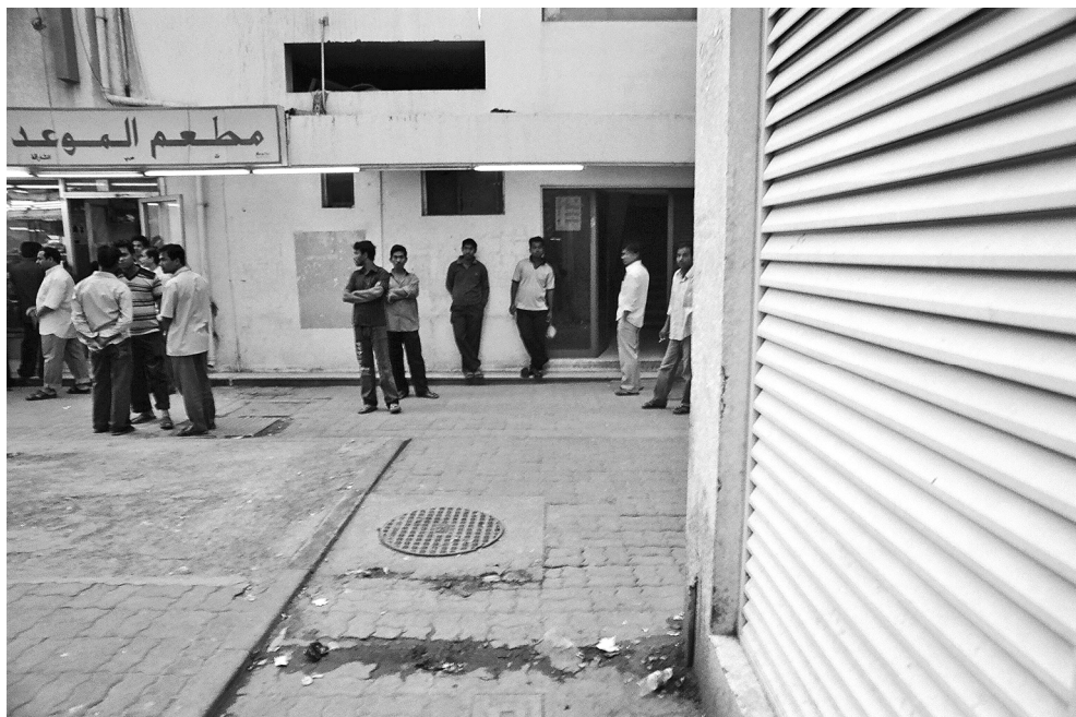
Figure 2. (Courtesy of the artist)