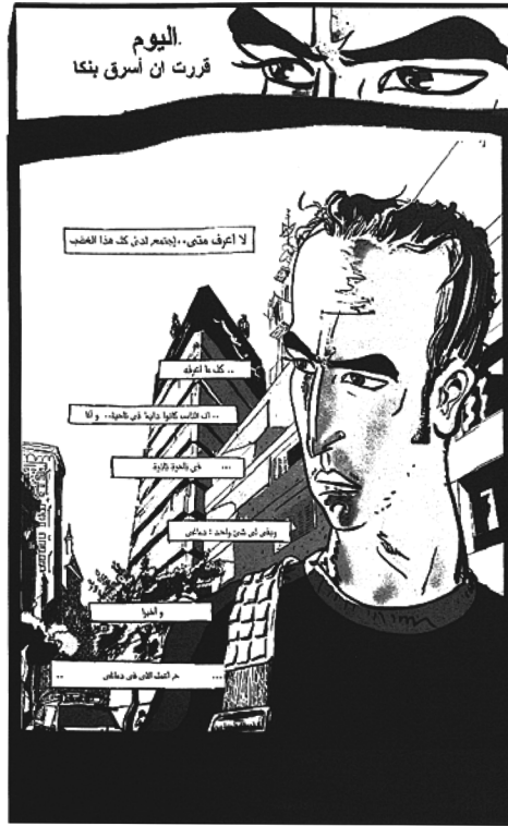
Figure 1 (al-Shāfi'ī 7)

at a Kefaya demonstration or by falling in love with Dina. The final sequence, when Shehab intends to symbolically leave the metro station called Mubarak, might be interpreted as the juncture where Shehab makes his dissent known: He leaves the subway, symbol of his underground activities and at the same time the political state under Mubarak. Like the other kifāya narratives, Metro exposes moments and feelings of kifāya , but it differs from them in its less generalizing representation of corruption, the optimistic vision of a vivid non-violent democratic opposition, and the subtle critique of resistance by all means possible. With respect to this critique I would like to analyze the predicament of violence and affects inherent to kifāya literature.