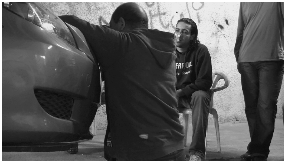
Figure 4.